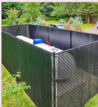
Shown with Eastern Privacy Slats (Sold Separately)

The System21 ® Fence System is available in your choice of black, green, and brown.