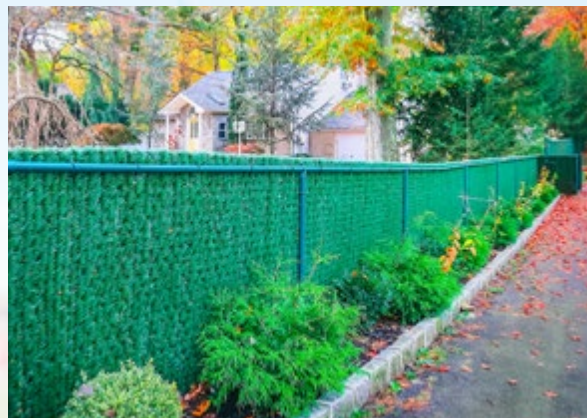
Shown in Green with Eastern Hedge Inserts (Sold Separately)