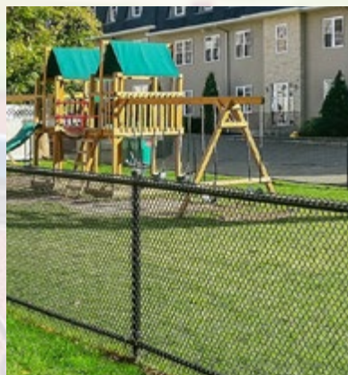
Non-Climbable Mesh Options