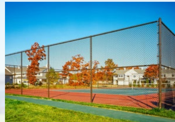
Tennis Court Fencing (Shown in Brown)