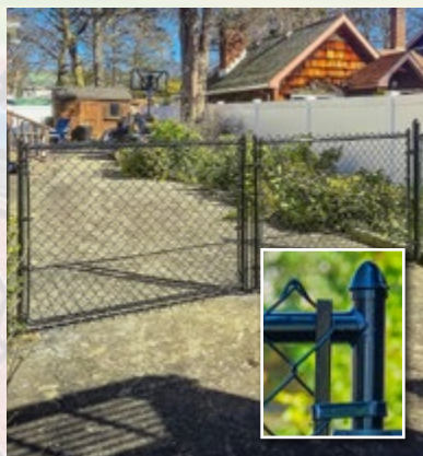
Matching Welded Driveway and Walk Gates