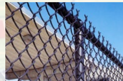
High-Security Heavy Gauges

There's always a System21 ® fence that's perfect for your installation!